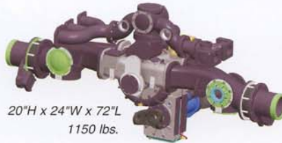
20"H x 24"W x 72"L 1150 lbs.